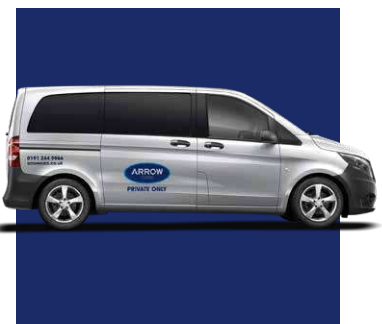
One of our Mercedes Vitos