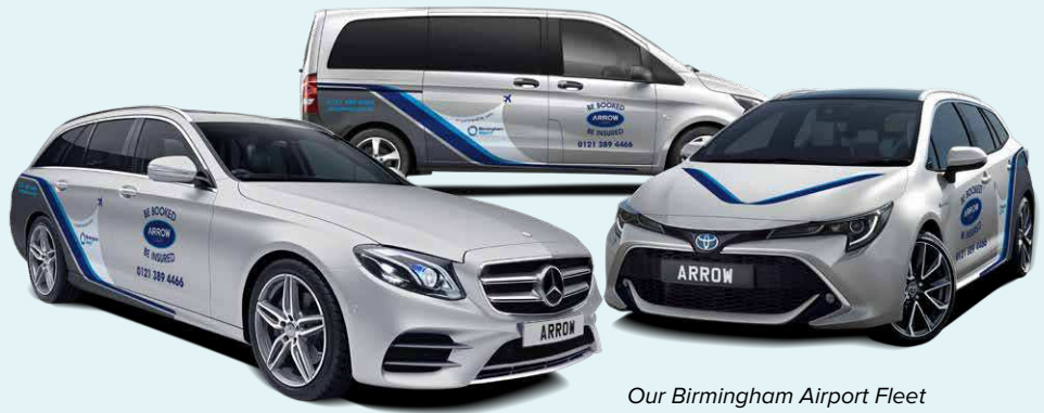
Our Birmingham Airport Fleet