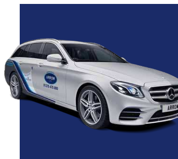
Our executive Mercedes E-class estate vehicle